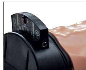
Man computer interface