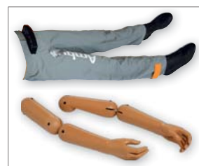
Arms and legs for Man