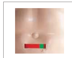
Compression depth indicator