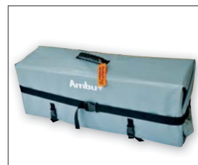
Bag for Man

Архангельск (8182)63-90-72 Астана (7172)727-132 Астрахань (8512)99-46-04 Барнаул (3852)73-04-60 Белгород (4722)40-23-64 Брянск (4832)59-03-52 Владивосток (423)249-28-31 Волгоград (844)278-03-48 Волгодга (8172)26-41-59 Воронеж (473)204-51-73 Екатеринбург (343)384-55-89